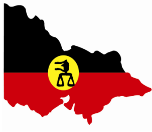
Victorian Aboriginal Legal Service Co-operative Ltd