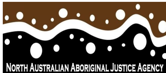
NORTH AUSTRALIAN ABORIGINAL JUSTICE AGENCY