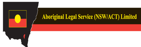
Aboriginal Legal Service (NSW/ACT) Limited