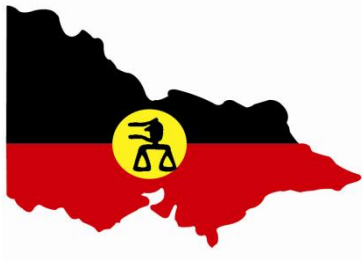
Victorian Aboriginal Legal Service Co-operative Ltd