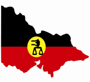
Victorian Aboriginal Legal Service Co-operative Ltd