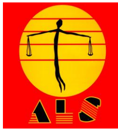
Aboriginal Legal Service of Western Australia